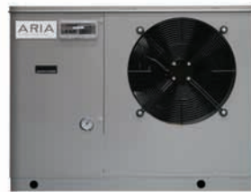
Air source heat pump

GOOD FOR YOU GOOD FOR THE ENVIRONMENT GOOD FOR YOUR POCKET !